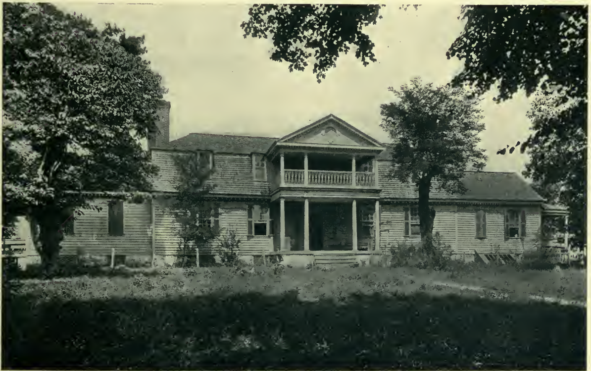
"TEDINGTON," SANDY POINT, CHARLES CITY COUNTY, VIRGINIA. Built in 1717

The scene of Thomas Jefferson's boyhood. It is the oldest of the James River frame mansions. The house reveals an interesting plan which is \Gamma in shape: the library, drawing-room and stair hall in one wing, with the ball-room connecting the rear wing, in which the dining-room, bedroom and second stair hall are located